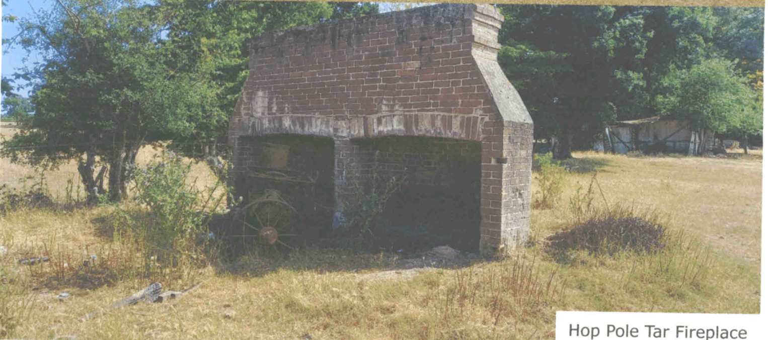
Hop Pole Tar Fireplace